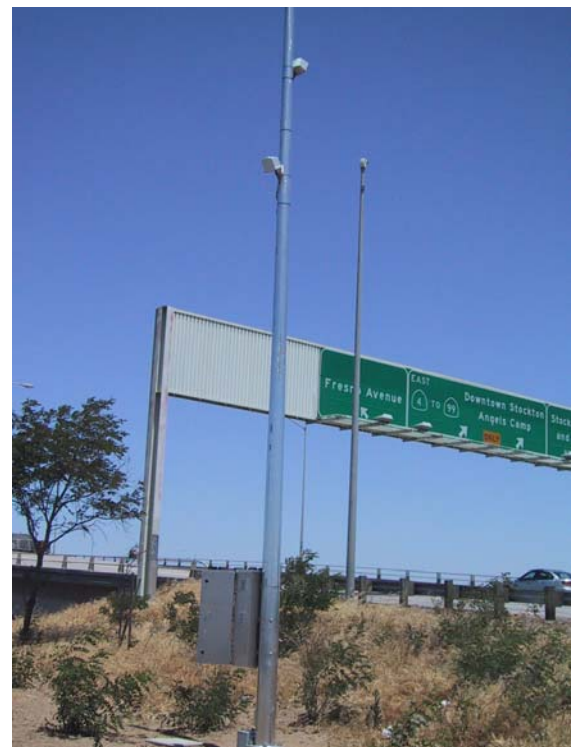
RTMS Permanent Counting Stations Traffic Reporter outputs